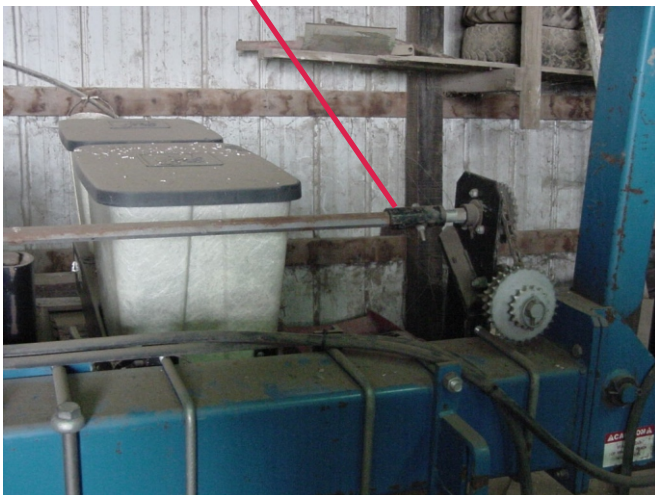
REMOVE THIS COUPLER